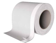
PLASTER BAND LITE page 69