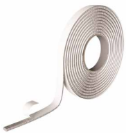
SUPRA BAND page 140