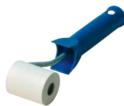
ROLLER page 393