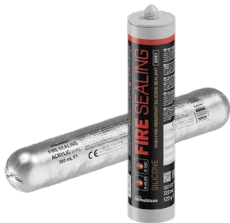
FIRE SEALING page 130-132