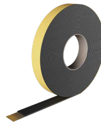
FIRE STRIPE GRAPHITE page 138