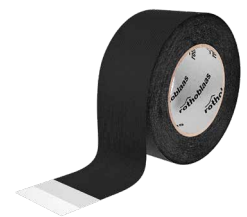
FRONT BAND UV 210 page 108